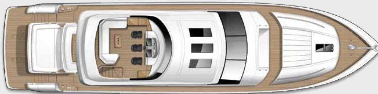
FLYING BRIDGE – DUAL STATION CONTROL LAYOUT