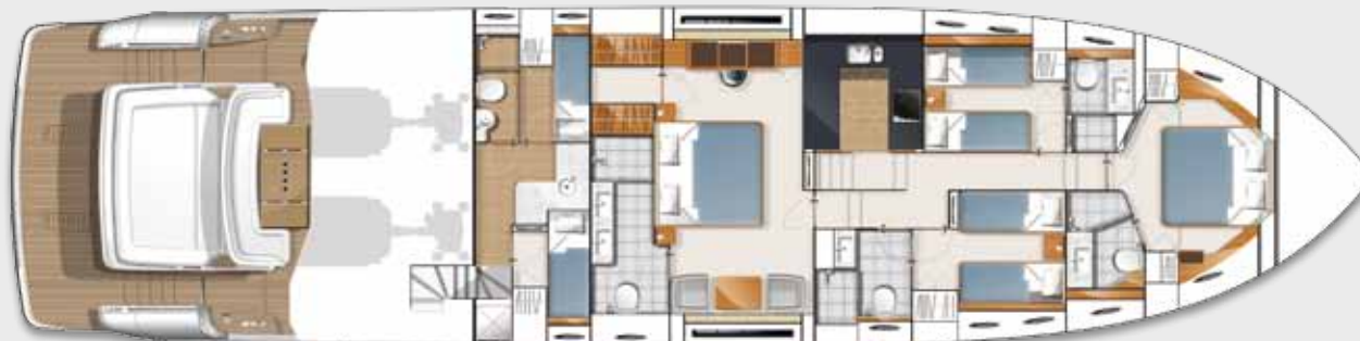
LOWER ACCOMMODATION LAYOUT