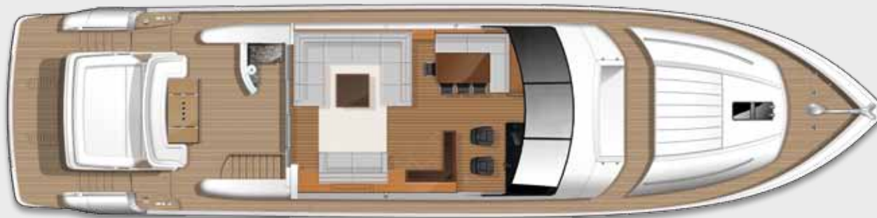
UPPER ACCOMMODATION LAYOUT