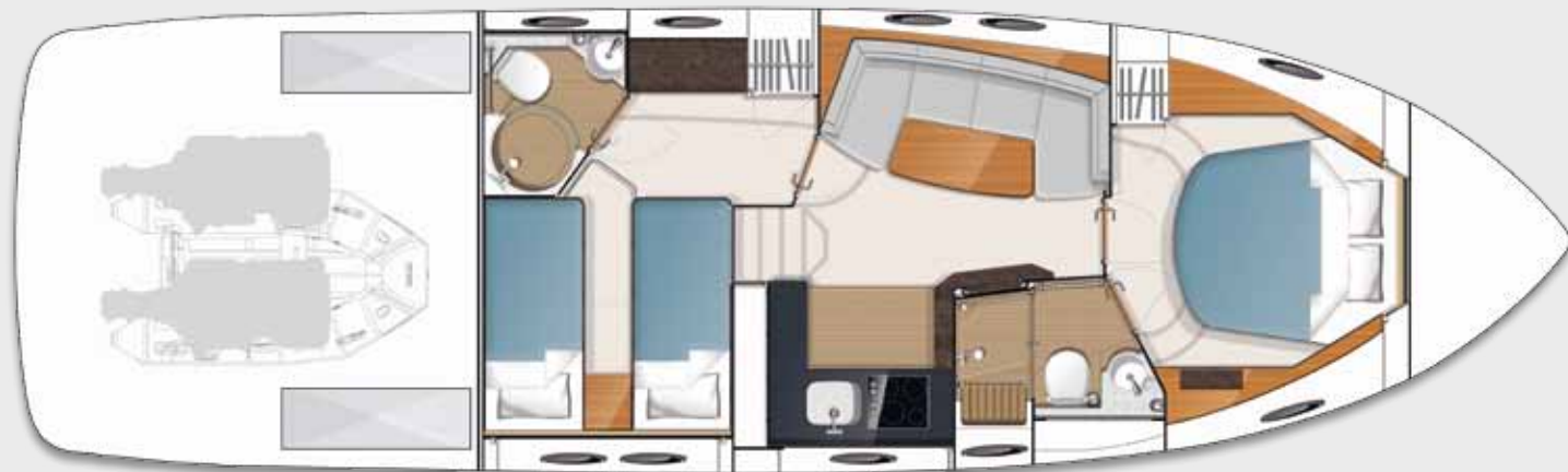
LOWER ACCOMMODATION LAYOUT