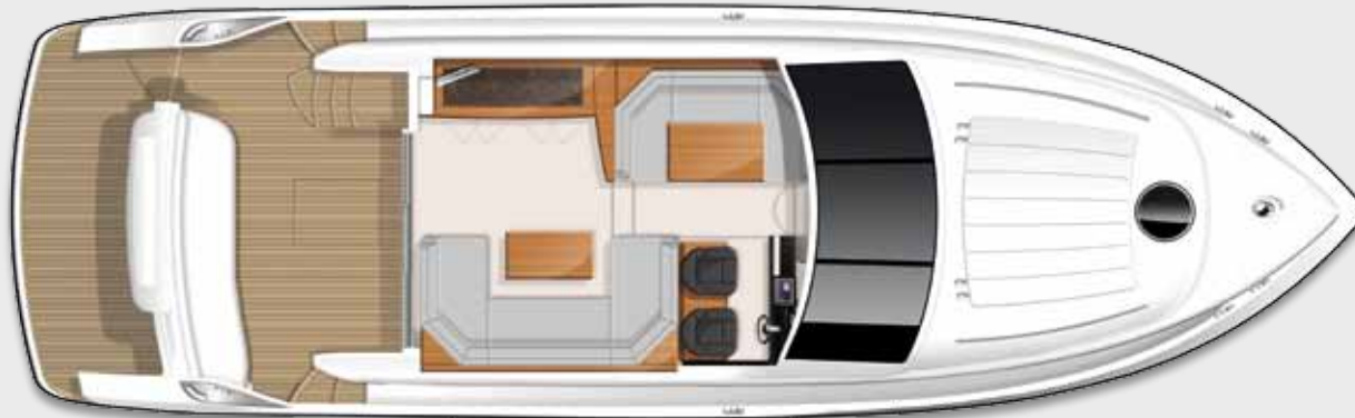
Upper Accommodation Layout