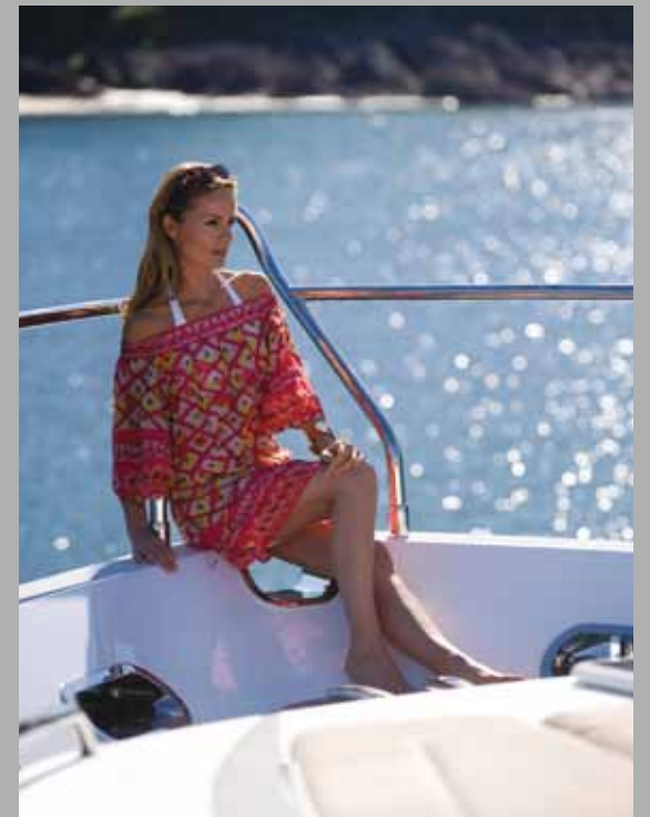
PRINCESS 85 MOTOR YACHT