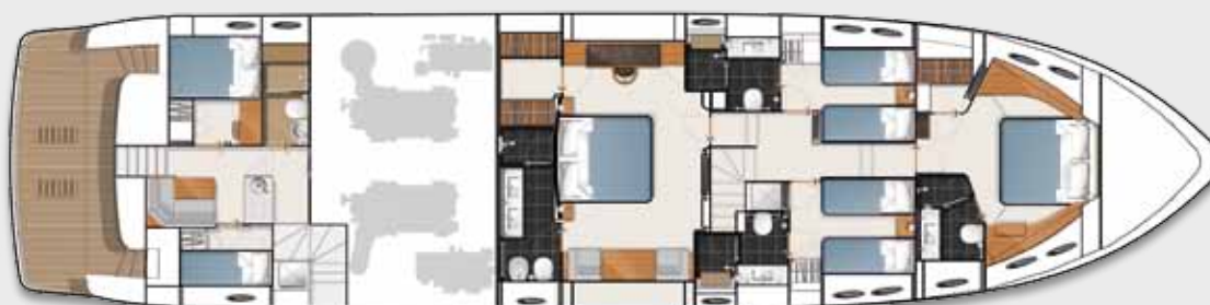
Lower Accommodation Layout