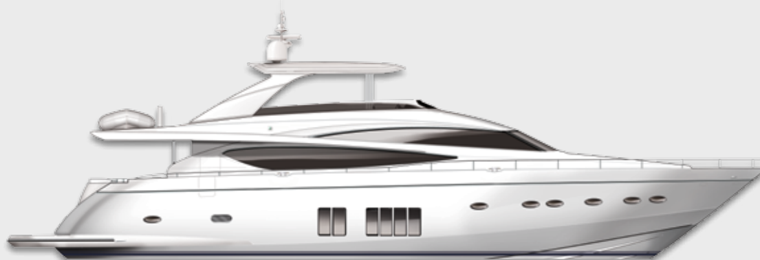
Profile with Optional Hardtop