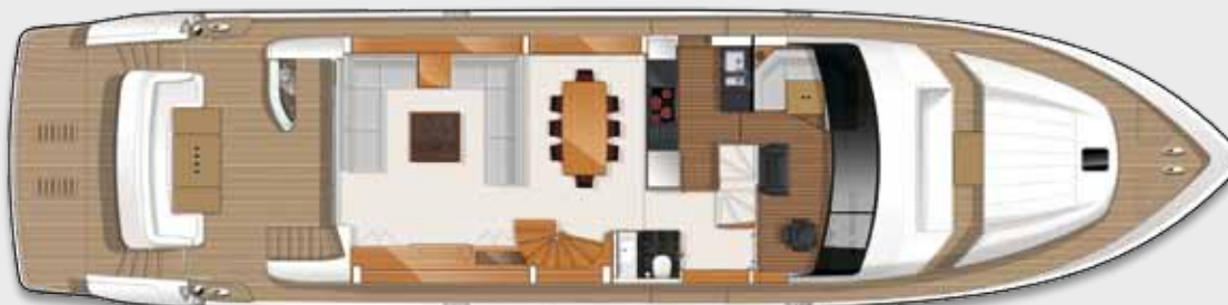
Upper Accommodation Layout with Optional Cockpit Bar