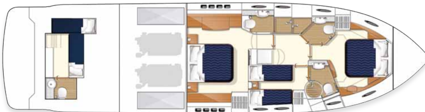
Lower Accommodation Layout