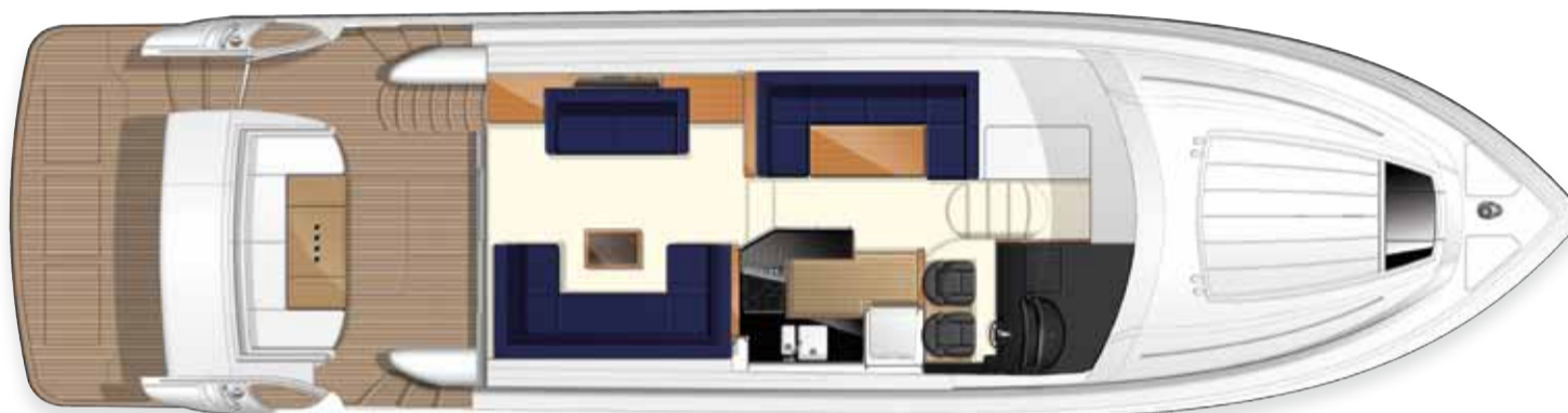
Upper Accommodation Layout